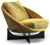
03 LIDO ARMCHAIR WITH BASE CM 93X99 H85